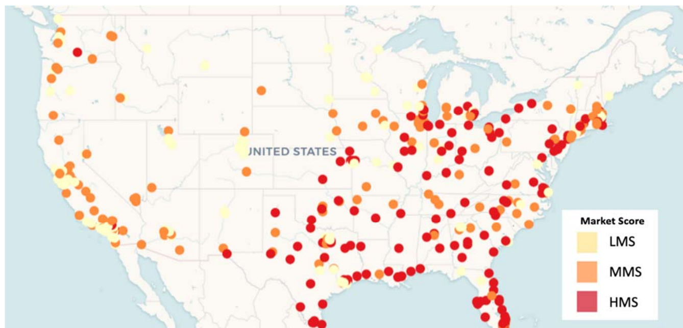
Figure 2. Map of 500 cities in the United States and their respective Market Score